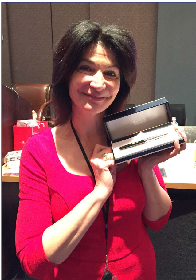
Above, NEA president Lily Eskelsen Garcia holds one of 10 pens that was used by President Barack Obama to sign the Every Student Succeeds Act on Dec. 10. At right, Garcia (left) and others applaud as the president signs the law that replaces No Child Left Behind.